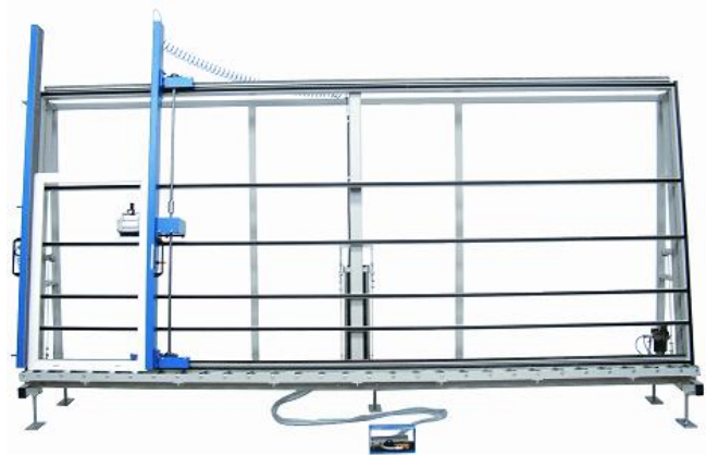
RU-VGP Frame press