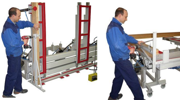
Installation of the support stand