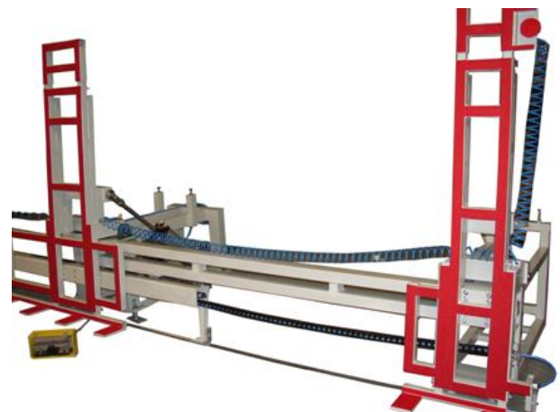
RU-MK-HS Extended right side