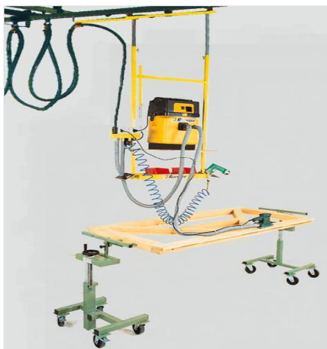
RU-GH-4 DEW with additional shelf Extendable from 1700 mm to 2800 mm.