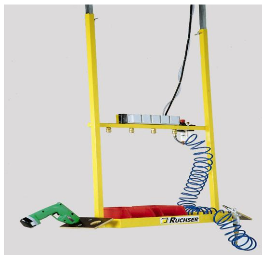
RU-GH-4DEW, 4 compressed-air- and 4 electric-connectors. Holder for hand-held-units